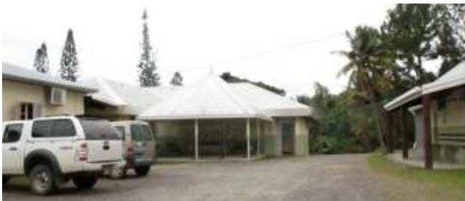
Photo: Health center, Pouebo, New Caledonia.

For instance, ways of communication are different. Kanaks speak French like their mother tongue, so there are no language barriers, but they have some communication peculiarities.