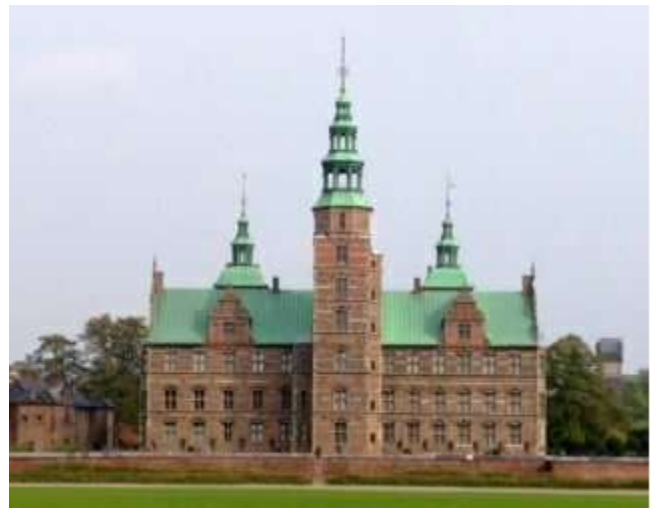
Photo: Typical green spires of Copenhagen

embraced electronic medical records, using WONCA's classification system, ICPC (International Classification of Primary Care), to code diagnoses. ICPC allows Danish GPs to analyse the content of their medical record systems to their own activity and to better understand the health needs of their patient population. Data from Danish general practices is transferred automatically from the electronic medical record systems to the Danish General Practice Database allowing primary care researchers in Denmark to investigate the health status of the whole community, analyse the quality of care being delivered, provide feedback to each GP about their own patient population, and make national recommendations for continuing improvements to health care delivery.