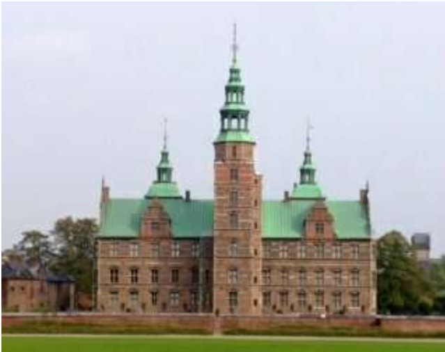
Foto: Agujas verdes típicas de Copenhague.