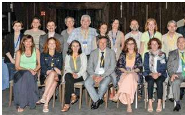
SemFYC Junta Directiva (executive Board) with some of the VIP guests also present.

More than 2,500 specialists in Family and Community Medicine attended the XXXIV semFYC annual meeting