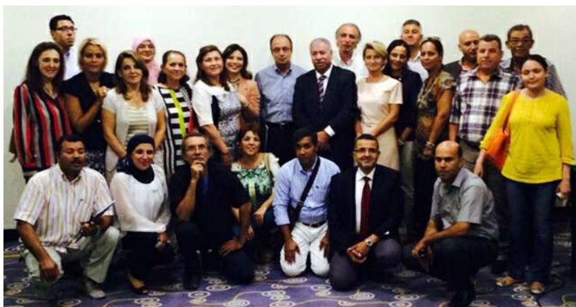
Photo: meeting participants