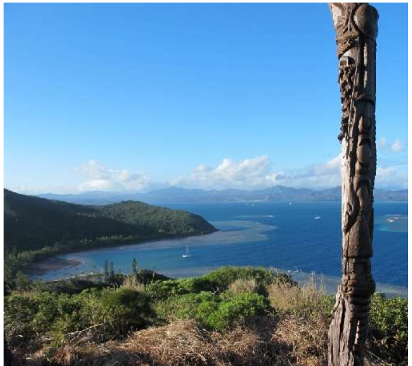
Photo: It's difficult to take a bad photo in New Caledonia (Isle Ouen, South of New Caledonia)

If you want to share your thoughts with Chloé why not join the discussion just started on the WONCA Forum Login to the WONCA discussion forum Join the WONCA discussion forum