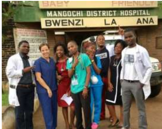
Photo: MBBS students in Mangochi

“Teamwork, encouraged to handover patients to each other, this allowed us to have follow-up, if things were missed our colleagues would let us know”, MBBS 4 Student.