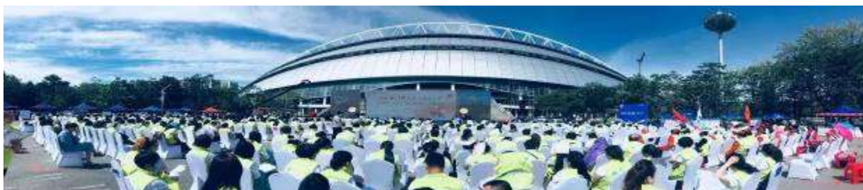
Photo of the main venue of Shenyang