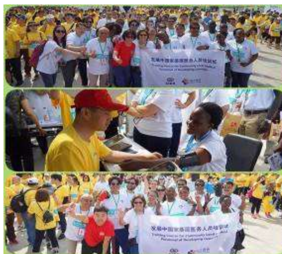
Photos of Celebration Activities in Beijing

On May 17, Beijing held a "519 World Family Doctor Day General Practice Academic Symposium". On May 19, Around 2000 people, including more than 900 family doctors from the Community Health Service Centers from 16 Districts, together with more than 1000 residents who had signed service contracts with these family doctors as well as staff from related departments of the municipal government, heads of social organisations, enthusiastic community health promotion volunteers participated in the "Together we walk, with our doc" brisk walking activity for health.