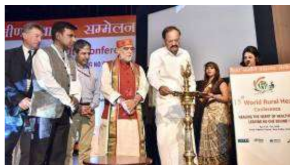
Photo shows the lighting of the lamp

coordinates comprehensive healthcare services with other specialists, as needed, Family physicians deliver a range of acute, chronic and preventive medical care services. ( more ).