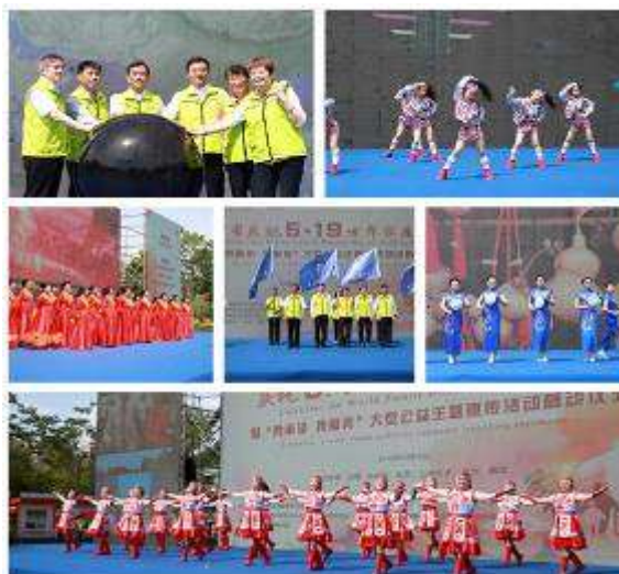
Photos of Theatrical Programs in Shenyang