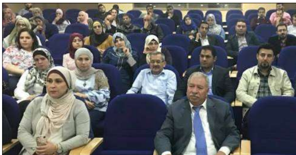
Photo at right- scientific activity.