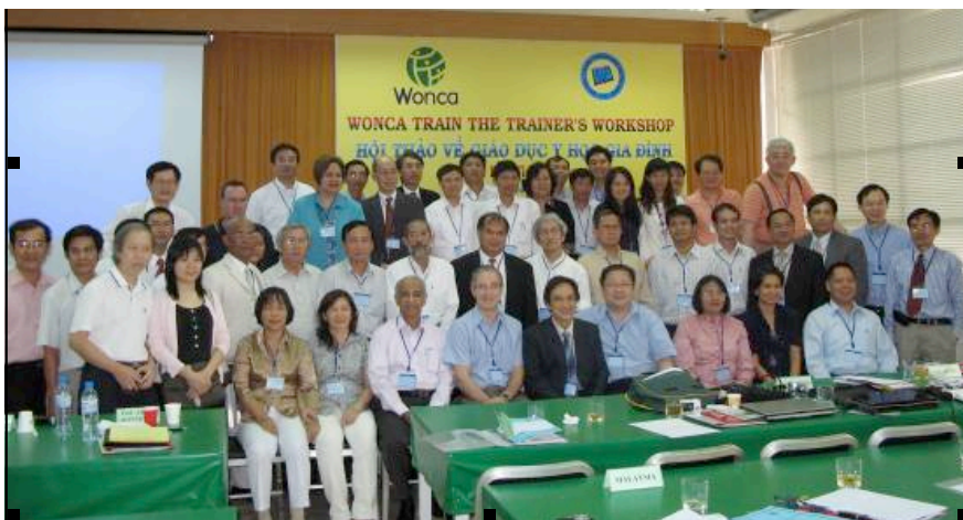
Group photo of participants from Vietnam, USA, Hong Kong, Singapore, Philippines, Cambodia, Laos, Malaysia and Indonesia attending the Wonca Train the Trainer’s workshop held in Ho Chi Minh City, Vietnam June 7-8th 2008

The meeting objective was to provide an opportunity for WONCA Asia Pacific member countries to share their experiences and challenges in training Family Doctors in their own countries. This objective was achieved through broad and positive interaction among the delegates. Successful team building occurred amongst member organizations around the region.