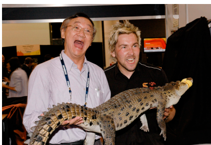
Crocodile and friends - the visitors meet the natives at the Welcome function

The RACGP and the conference convenors thank Wonca for the opportunity to host the 2008 Wonca Asia Pacific Regional Conference. We particularly thank all the delegates who contributed to such a successful, friendly and enjoyable event.