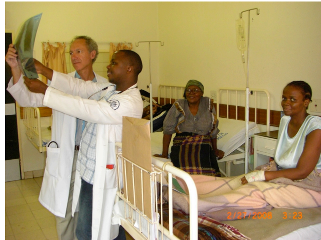
Lesotho Family Medicine

The intention of the Family Medicine Training Program is to increase the number of well trained district physicians in Lesotho who have the knowledge, skill and commitment needed to meet the health care needs of the people of Lesotho. Concurrently, LeBoHA is working