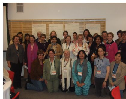
The Woman and Family Medicine Working Party at the Asia Pacific Regional pre-conference in Melbourne

The WWPWFM had a regional pre-conference in Melbourne, with around 40 people, and welcomed many new contacts at the main meeting workshops. In addition, members of the Wonca World Executive visited our meeting, and were highly supportive of our ongoing work, also mentioning the importance of gender