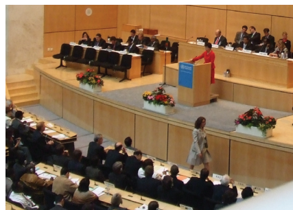
WHO Director General Dr Margaret Chan Speaking at the 62nd World Health Assembly