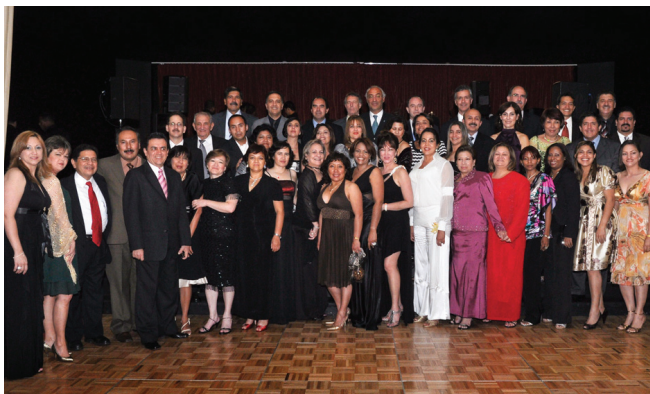
Social activities during the evening Presidential Reception