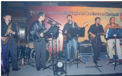
Band performance during the Conference Banquet by The Hong Kong College of Family Physicians