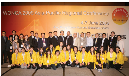
Group photo of Hong Hong's Host Organizing Committee members, Scientific subcommittee members, Council members and College Staff