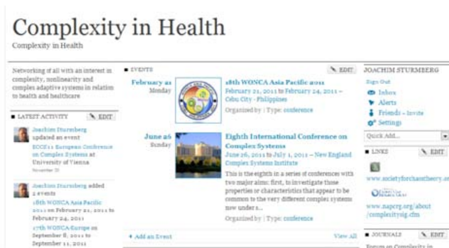
SIG on complexity website

Web-presence: http://complexity-in-health.ning.com/