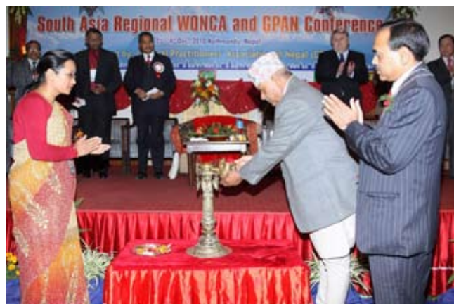
Conference inauguration by the President of Nepal, Dr Ram Baran Yadav.

Iberoamericana-CIMF. The idea has now taken root and moves are now being made to formally institute such a body, in Wonca South Asia, by member organizations, to be called “The Spice Route” Movement.