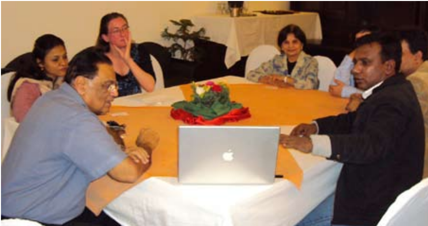
Working party of The Spice Route - participants from India, Pakistan and Nepal