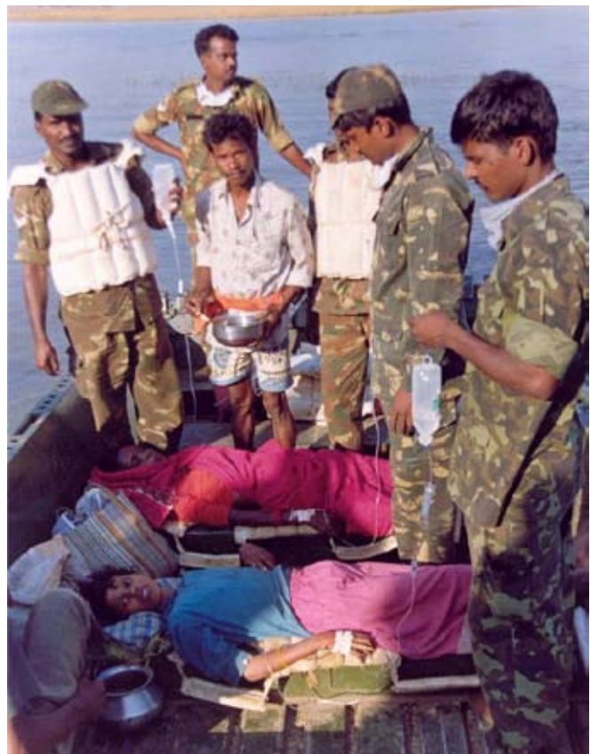
A local team at work in India